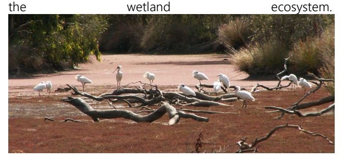
Lake Bartlett Service Street, Tatura

Cussen Park is a bushland style park encompassing 33 hectares of wetlands, woodlands and open space on the Northern outskirts of the town of Tatura. The land which forms Cussen Park is surrounded by industrial, residential and irrigated farm land. Cussen Park features constructed wetlands, bird hides, observation decks and well developed paths and signs allowing people to closely observe many bird species otherwise not possible. Experience the Hear & There Sound Walk – an innovative audio tour experience supported by interpretive signage that guides you through the