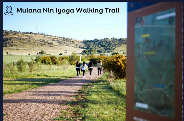
Mulana Nin Iyoga Walking Trail