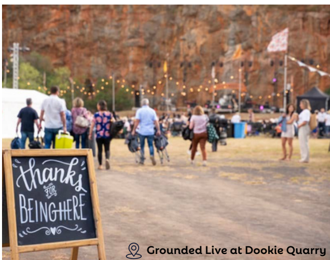
Grounded Live at Dookie Quarry