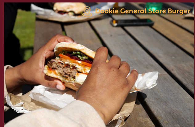
Dookie General Store Burger