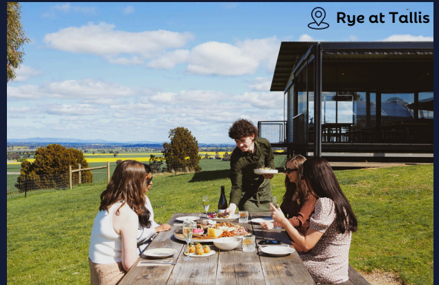
Rye at Tallis

As a guide diners typically spend $40-$60 here. Allow plenty of time to relax and take in the views over a delicious meal.