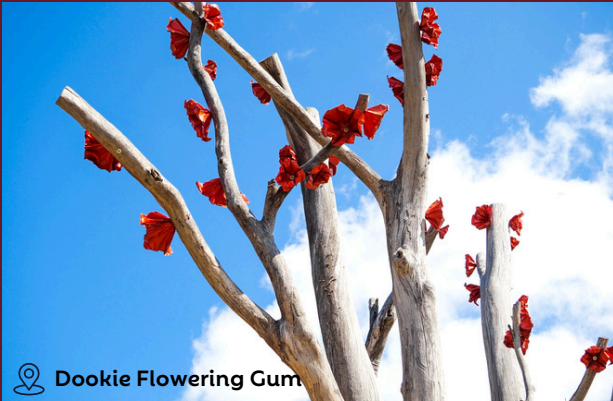
Dookie Flowering Gum

This Dookie Rail Trail is a picturesque trail, perfect for a gentle ride or stroll traversing some of the Goulburn Valley's most fertile farm land nestled between Mt Saddleback and Mt Major. The trail stretches out in two directions from the centre of Dookie Township. Stage 1 takes you eastward for 4.7kms as you gently meander towards the Yabba flats with their olive and orange groves, vineyards, cropping lands and the ever memorable Dookie Red loams. Stage 2 trail heads westward for 3kms from the former Dookie Railway station platform, offering open views, with low foliage and less undulation.