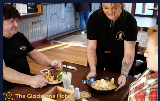
The Gladstone Hotel