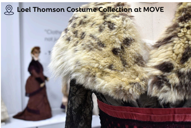
Loel Thomson Costume Collection at MOVE

Relax and explore Dookie and surrounds at your own pace