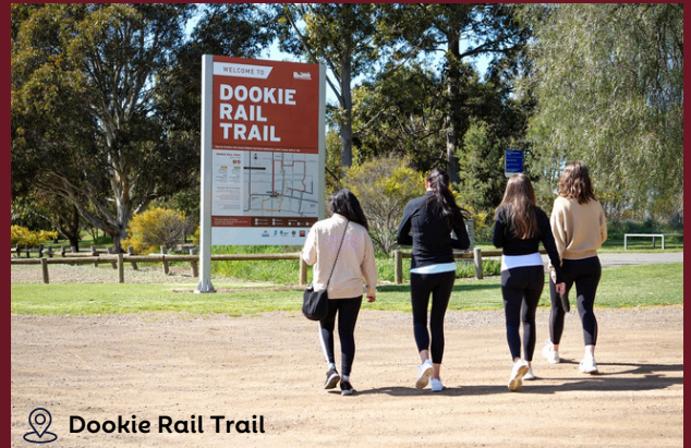
Dookie Rail Trail

Relax and explore Dookie and surrounds at your own pace