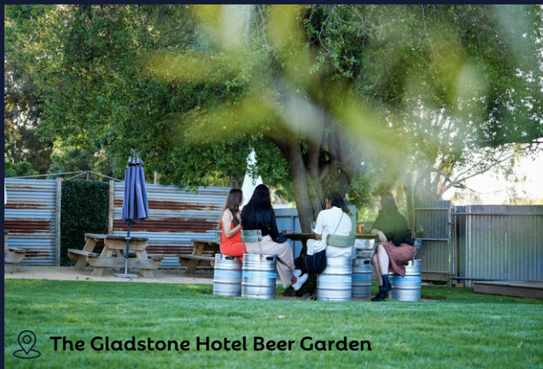
The Gladstone Hotel Beer Garden